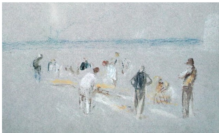
Fig 3. J.M. Turner 'Cricket on Goodwin Sands' (c1828-1830, J. M. W. Turner) 17